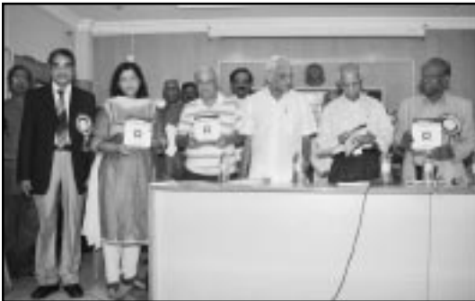
Release of "Pensioners' Hand Book" by Coffee Board Pensioners' Association (CBPA)

The Cultural Event by members of SAMARTHANAM TRUST FOR DISABLED was very much appreciated by the audience. The meeting ended at 1.30 PM with a lunch.