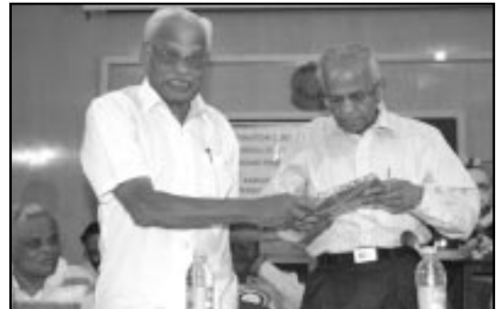
Release of Special Issue of "Pensioners' Champion" - December 12 issue by K P&T PA