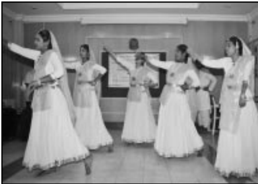
Cultural Event by Samarthanam Trust for Disabled